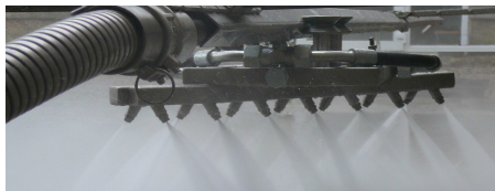
Nettoyage d'aéroréfrigérants en raffinerie- Procédé "Ax System "